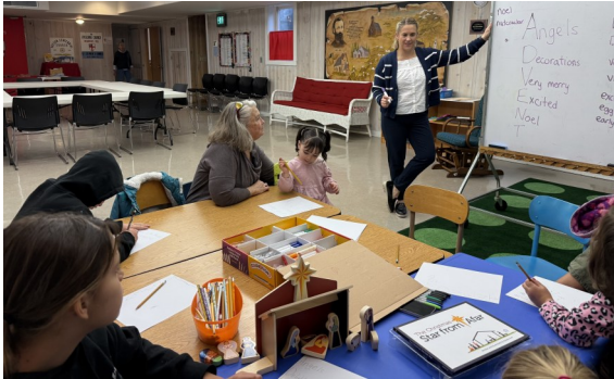
Learning in Sunday School